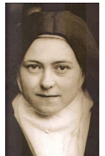
Photo of St. Thérèse of Lisieux (1873-1897), taken at the Carmel of Lisieux., Spring 1895