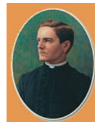
Father Michael J. McGivney

Council meetings start at 8:00 pm on the 2nd and 4th Tuesdays each month. Come join us!